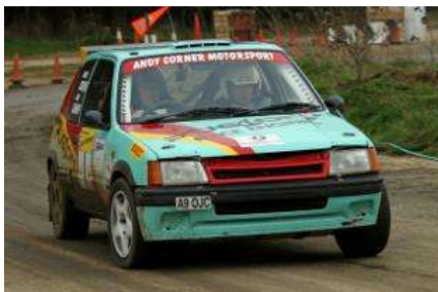
2015 Overall Winners – Andy Corner & Ade Camp